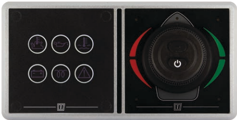
XTASF2P + MPA1MB + DBPPJA