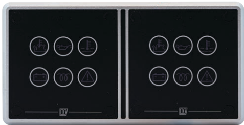
XTASF2P + MPA1MB + MPA1MB