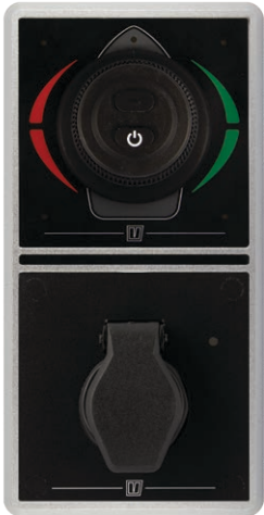
XTASF2P + DBPPJA + MPA1KB